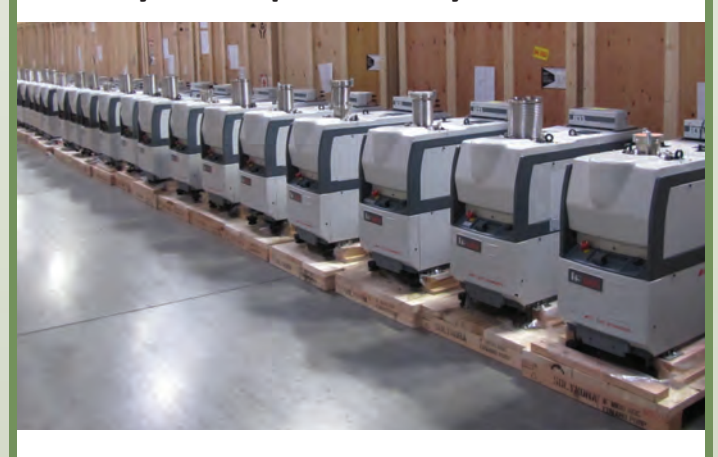
Over 100 Systems Always in Stock