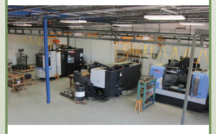
State of the Art Machining Center