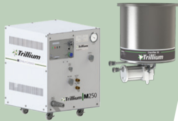
New, Exchange, Refurbished Units & Expert Service

Trillium is your single source for expert Service, Exchange, New & Refurbished Systems and Parts. With 3 nationwide locations, an in-house machine shop, and ready-to-ship inventory, customers love our short lead times and competitive costs. Plus, our ISO-9001 certified quality system and decades of expertise allow us to deliver top-notch products and services every time. Clients find us easy to do business with due to our sophisticated back office systems, customized weekly status reports, flexible pricing options, and our popular equipment buy-back program.