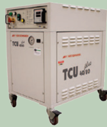
Factory Service, Parts & Support