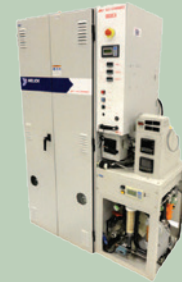
Refurbished Systems & Field Service