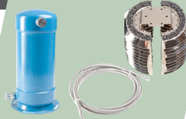
Cryogenic Spare Parts, Replacement Kits & Accessories