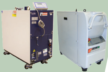
Expert Service, Exchange & Refurbished Units