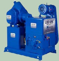
New Rough Pump, Blowers & Piston Pumping Packages