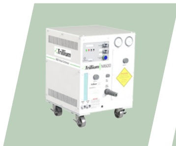
M Series Helium Compressors